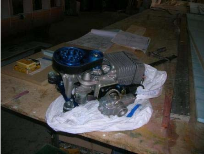
Simonini 28 hp with Belt Reduction